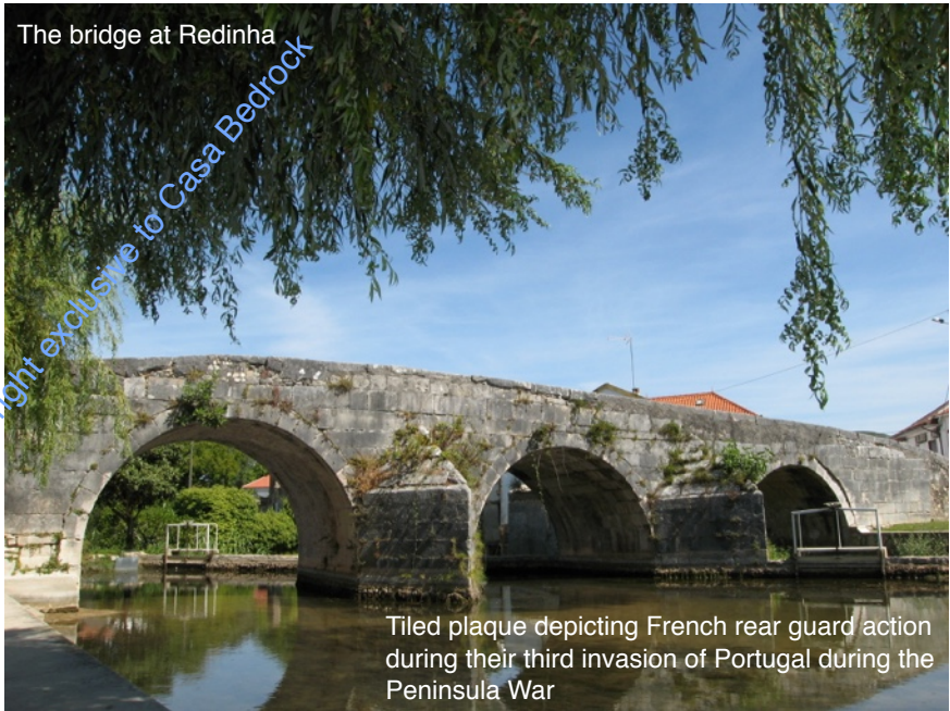
Tiled plaque depicting French rear guard action during their third invasion of Portugal during the Peninsula War