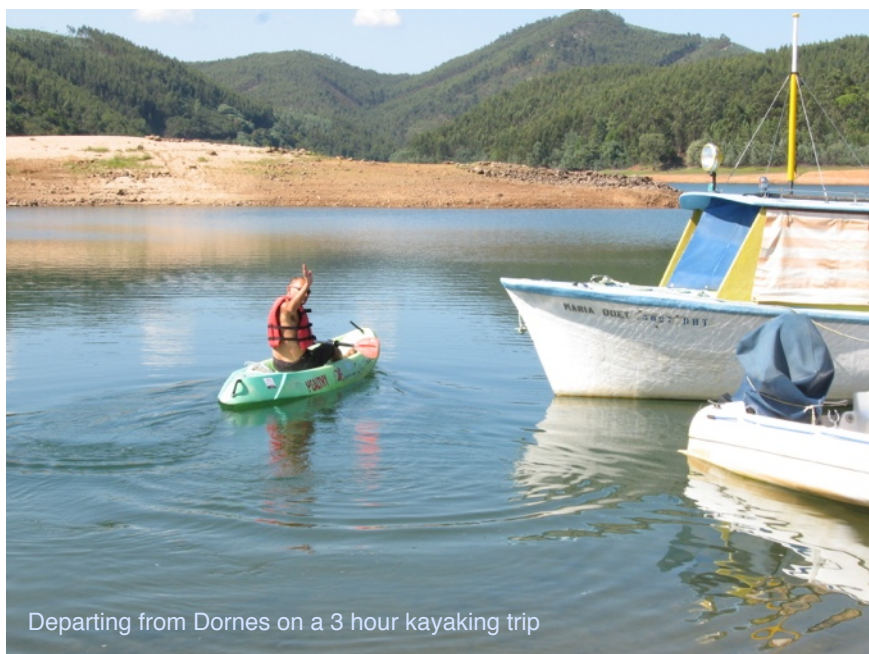
Departing from Dornes on a 3 hour kayaking trip